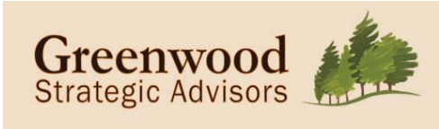
Sponsor of Conference Banquet