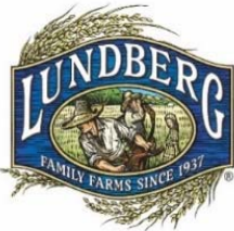
Sponsor of Conference Satchels